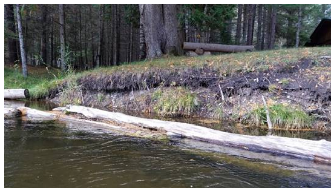
Erosion site selected for remediation

The reason Huron Pines identified sand as one of the greatest threats to the North Branch watershed is due to its effect upon invertebrate development and trout spawning. Both of these need gravel to develop successfully. If the gravel is covered by sand, insect growth and trout spawning success are greatly diminished. To decrease the amount of sand that is entering the North Branch, the Watershed Committee has begun selecting and prioritizing sites to begin mitigating erosion. The first site has been selected and work will begin as soon as river water levels allow that to happen.